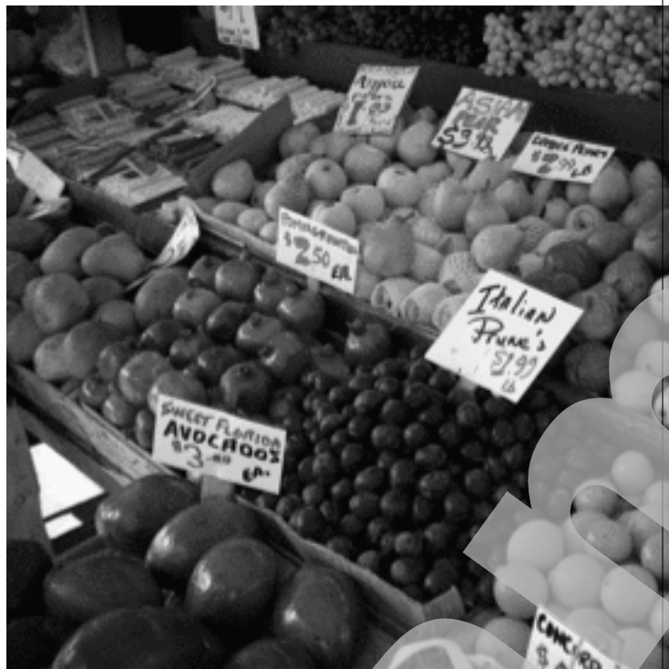
Produce at a Farmers' Market

(1) Many families do their grocery shopping at superstores. (2) In these giant retail centers, people can find items such as batteries, strawberries, diapers, lamps, dog food, and lawn equipment—all in one stop. (3) While they are admittedly convenient, shopping for fruits and vegetables at a local farmers' market would be a better choice. (4) Buying from local farmers gives consumers tastier, more nutritious food, and it benefits the environment at the same time.