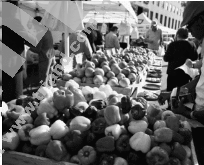
Shoppers Examining Produce at a Farmers' Market

(11) Locally grown food not only tastes better but is also better for your health. (12) Fruits and vegetables picked when they are ripe are at the peak of their nutritional value. (13) That's because their nutrients come from the living plant. (14) When an apple is harvested—or separated from its living plant—it's as nutritious as it's ever going to be; the apple actually decreases in nutritional value each day after that. (15) Since local farmers can get their produce to consumers much faster than superstores, their fruits and vegetables are rich in nutrients. (16) This shortened travel time also allows local farmers to use few, if any, preservatives. (17) Furthermore, consumers are buying directly from the farmer, so they can find out whether the food is free of pesticides and other chemicals. (18) All these factors combine to make locally grown food a much healthier option.